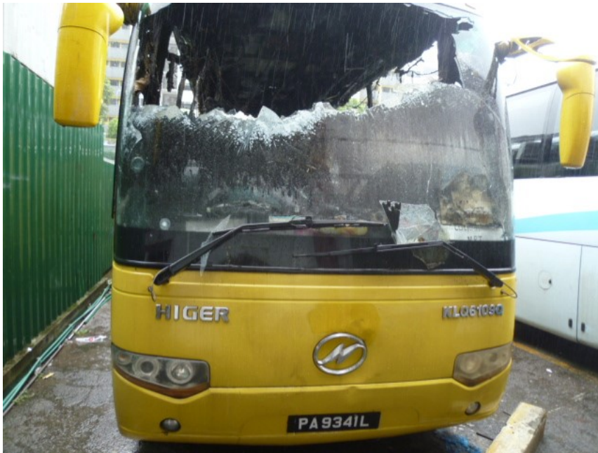
The frontal portion of the Insured Vehicle during our inspection.