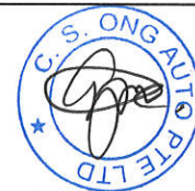
C. S. ONG Auto Pte Ltd