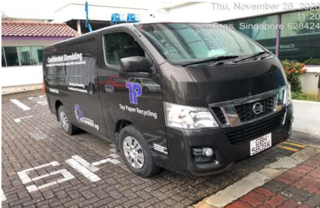
Photo 1 RH FRT VIEW

Areas indicated by Green markings are deemed consistent and areas or parts indicated by Red markings are not consistent.