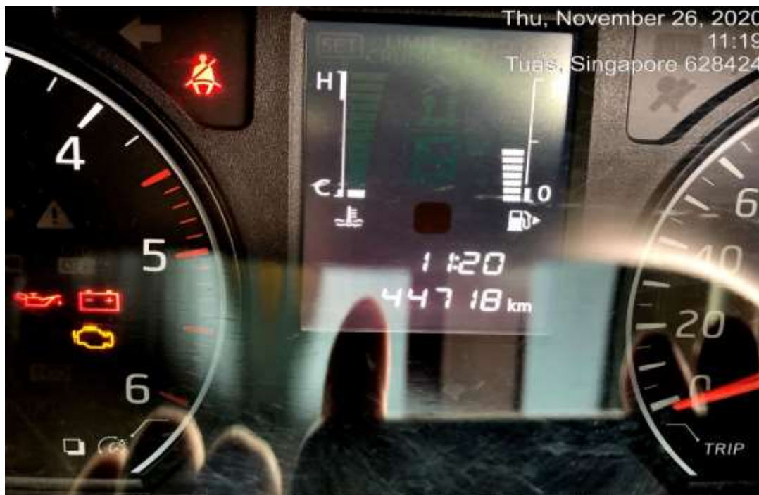
Photo 15 ODOMETER READING