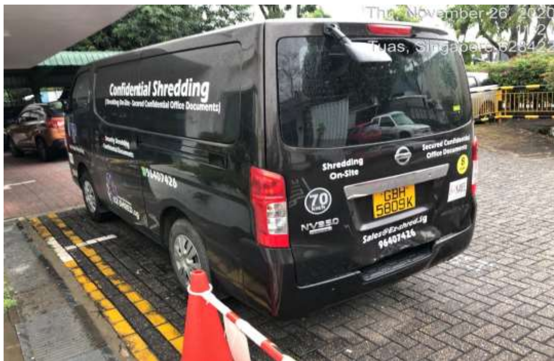
Photo 4 LH RR VIEW