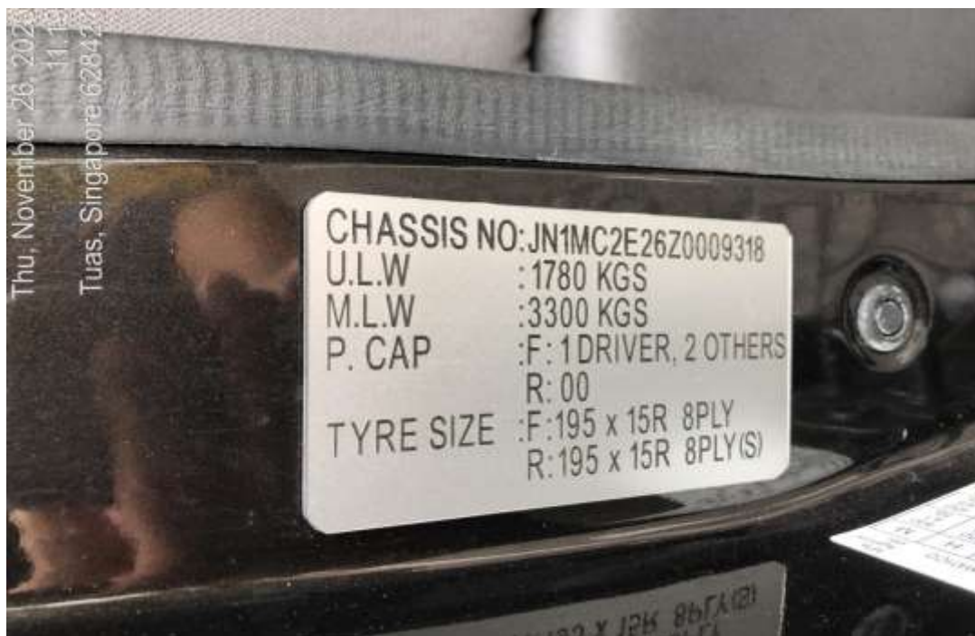
Photo 16 CHASSIS LABEL