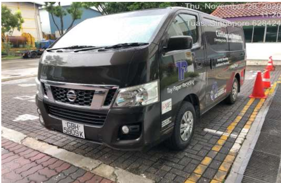
Photo 2 LH FRT VIEW