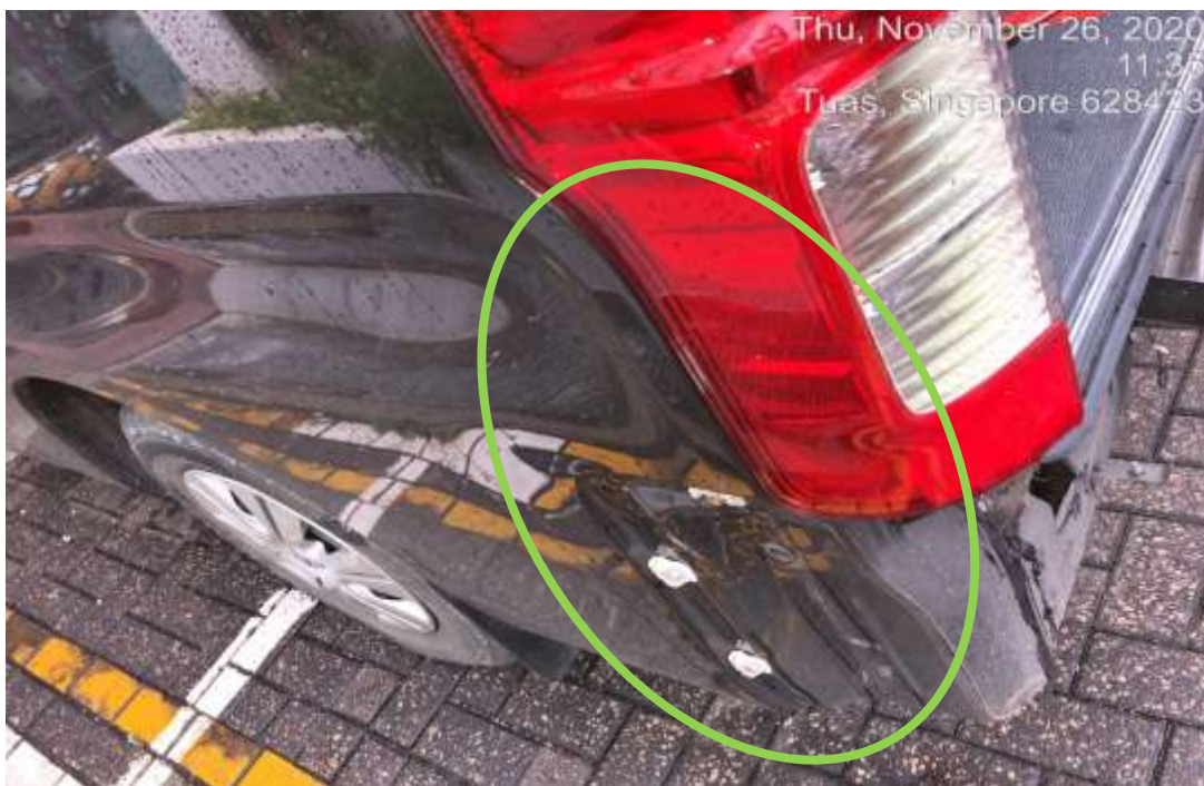
Photo 8 BUCKLED LH RR SIDE PANEL