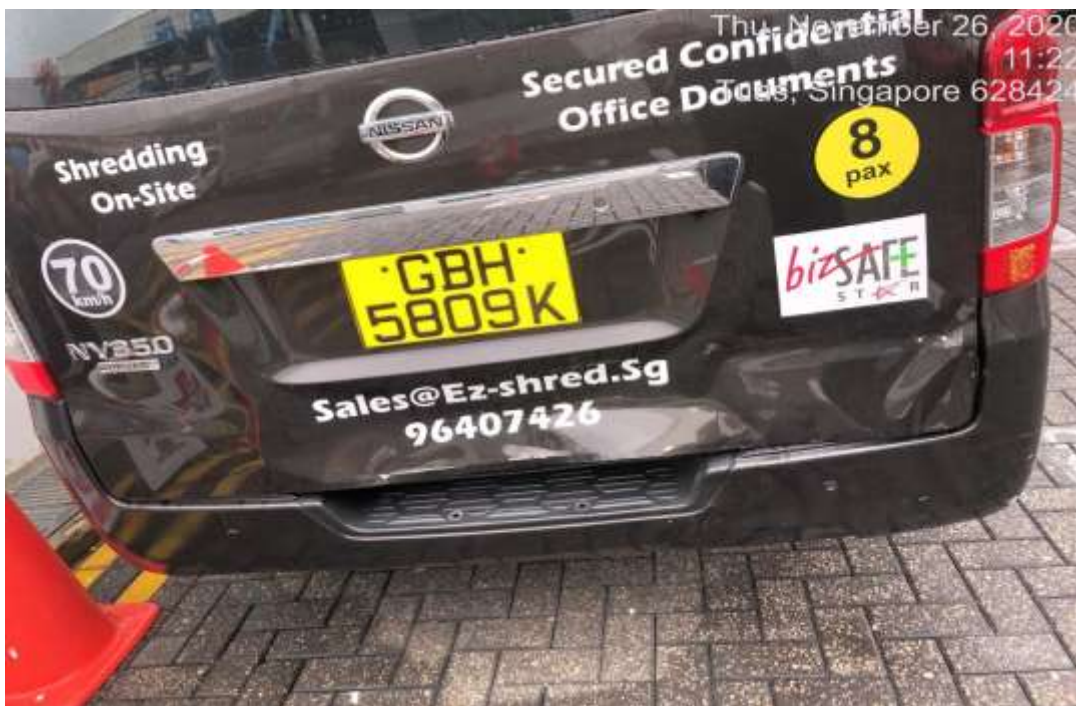
Photo 6 DENTED TAILGATE & DEFORMED RR BUMPER COVER