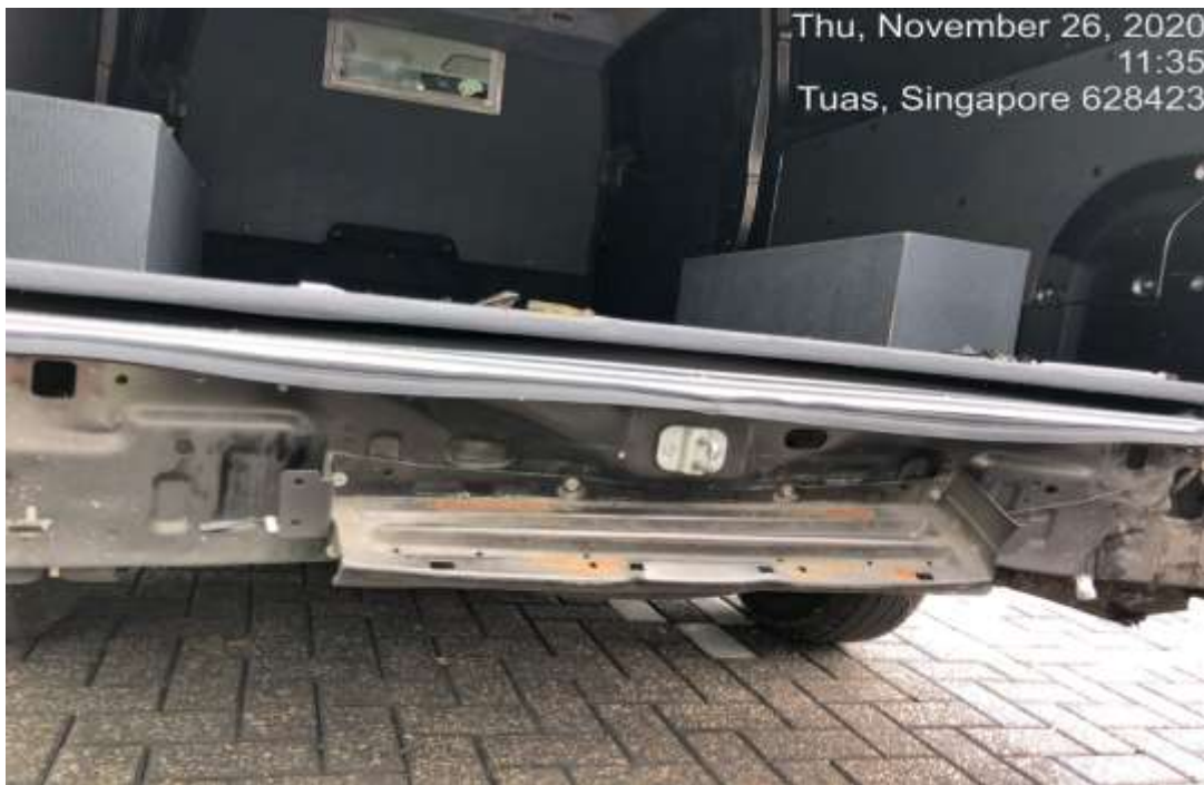
Photo 13 BUCKLED RR FLOOR PAN & TOP COVER BOARD