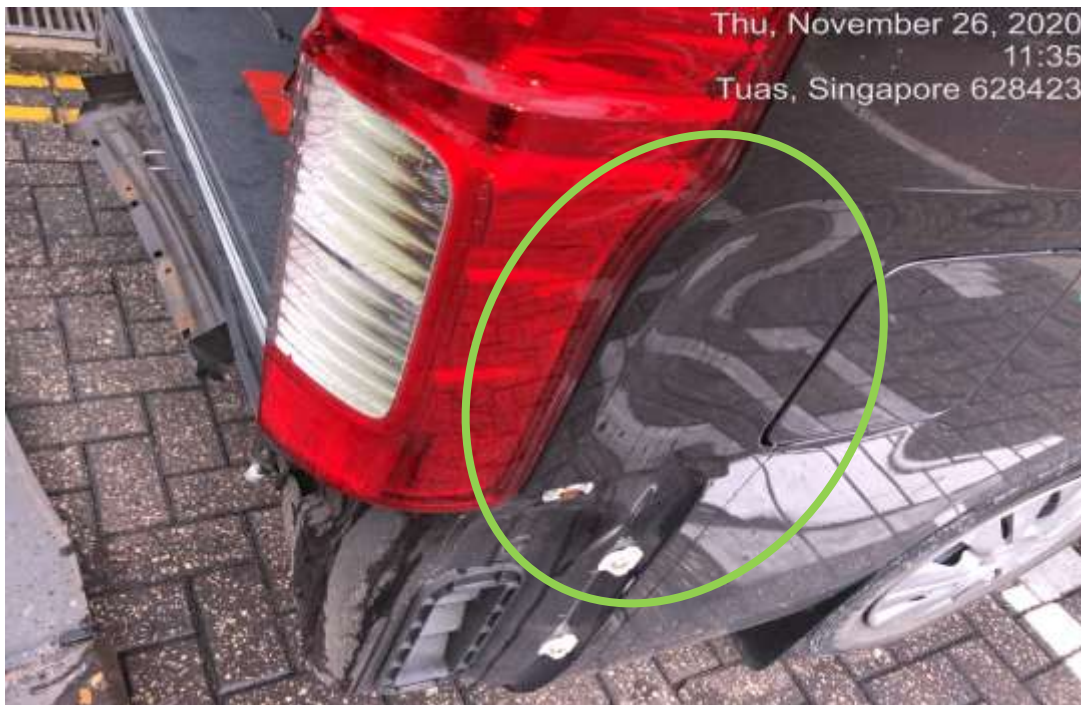
Photo 7 BUCKLED RH RR SIDE PANEL