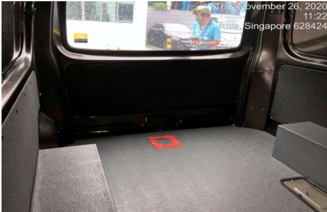
Photo 9 JAMMED TAILGATE