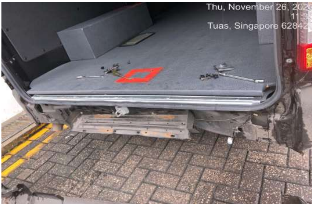
Photo 11 RR END DAMAGED PARTS DISMANTLED