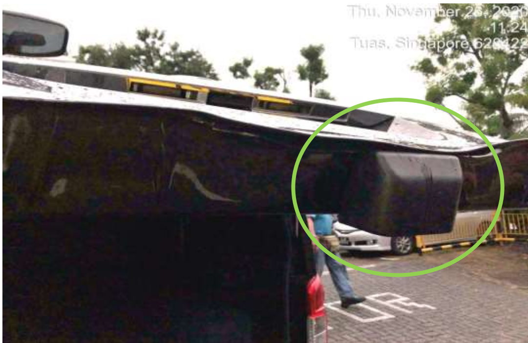
Photo 10 JAMMED TAILGATE LOCK