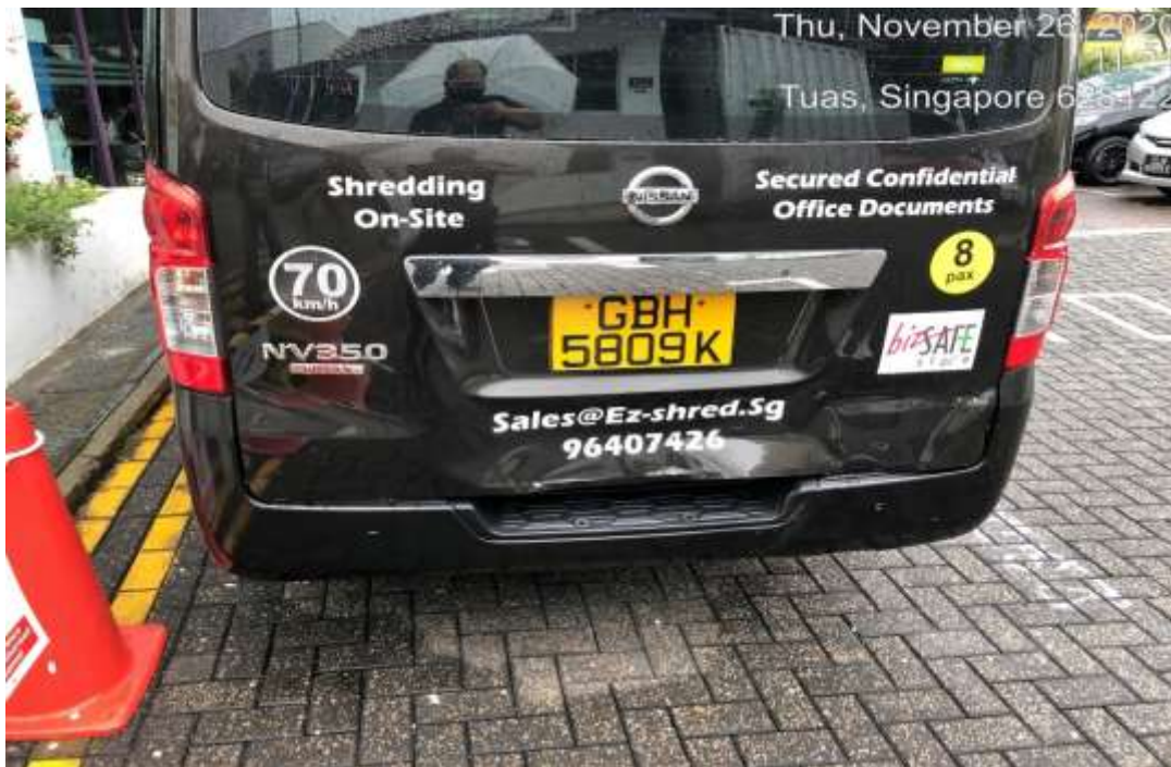
Photo 5 RR END GENERAL DAMAGED VIEW