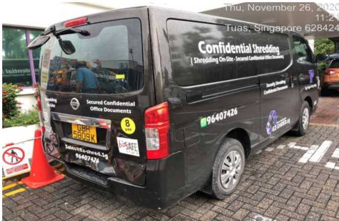
Photo 3 RH RR VIEW