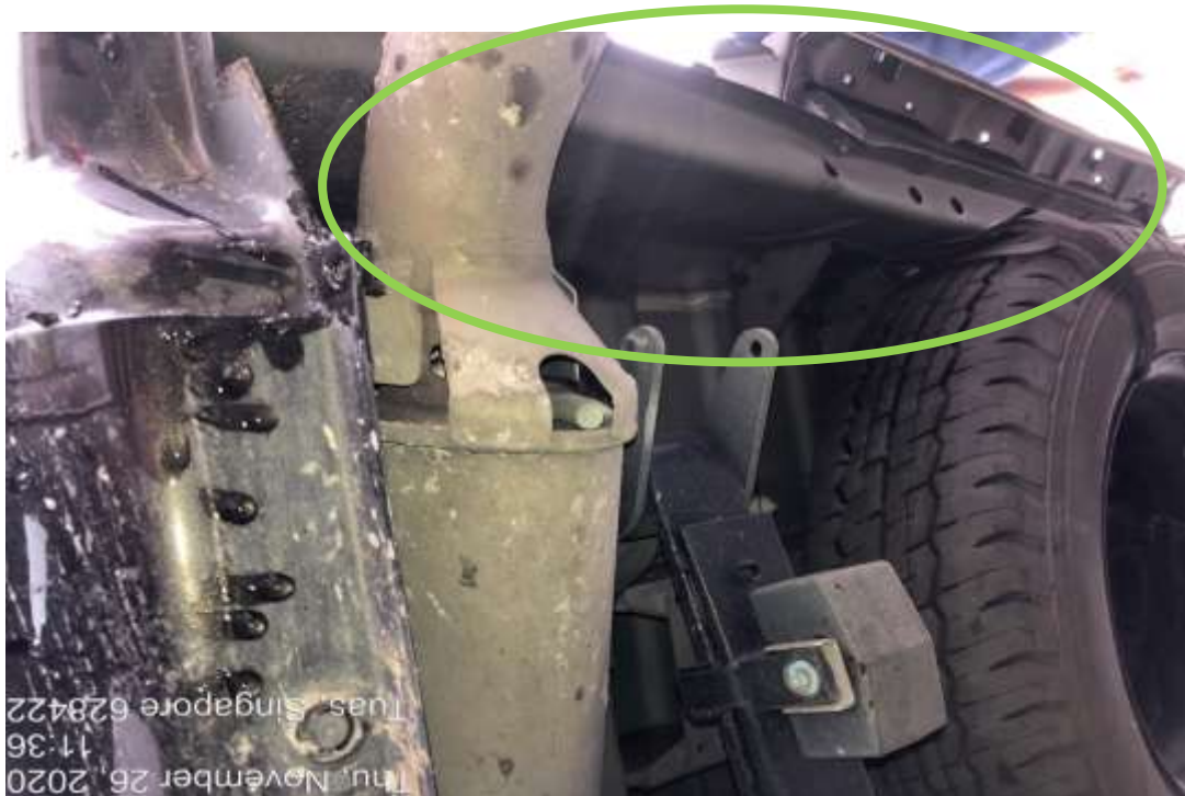
Photo 14 DENTED RR END OUTER & INNER PANELS