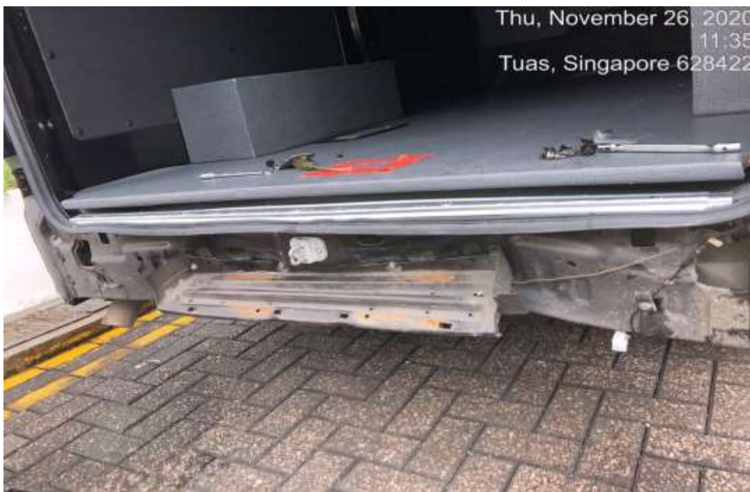
Photo 12 DENTED RR STEP BRACKET & REAR END PANEL