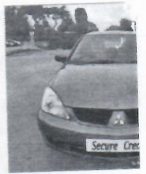
Mitsubishi Lancer 1.6i 09/2022)