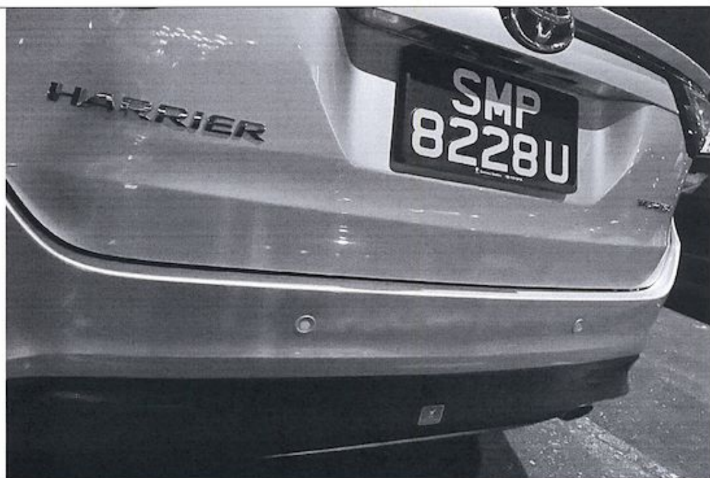
Photo 3 Close up shot