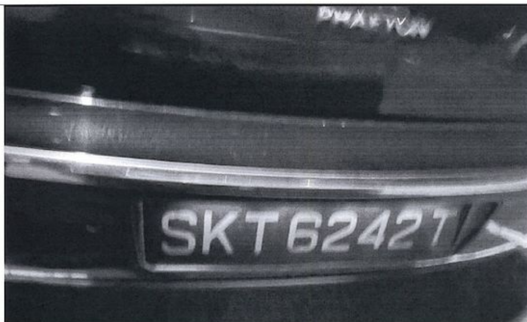
Photo 2 close up shot