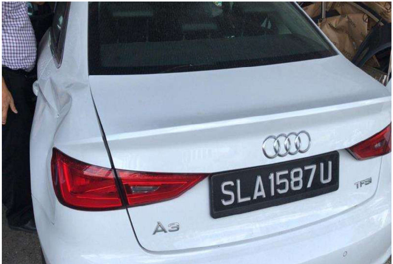
Photo 14 REAR BOOTLID PANEL VIEW