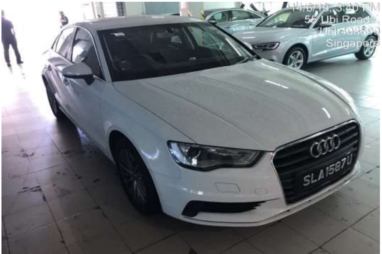
Photo 3 RHF VIEW