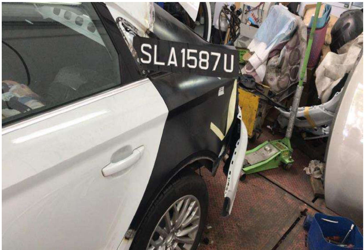
Photo 20 BEFORE PAINT VIEW 4