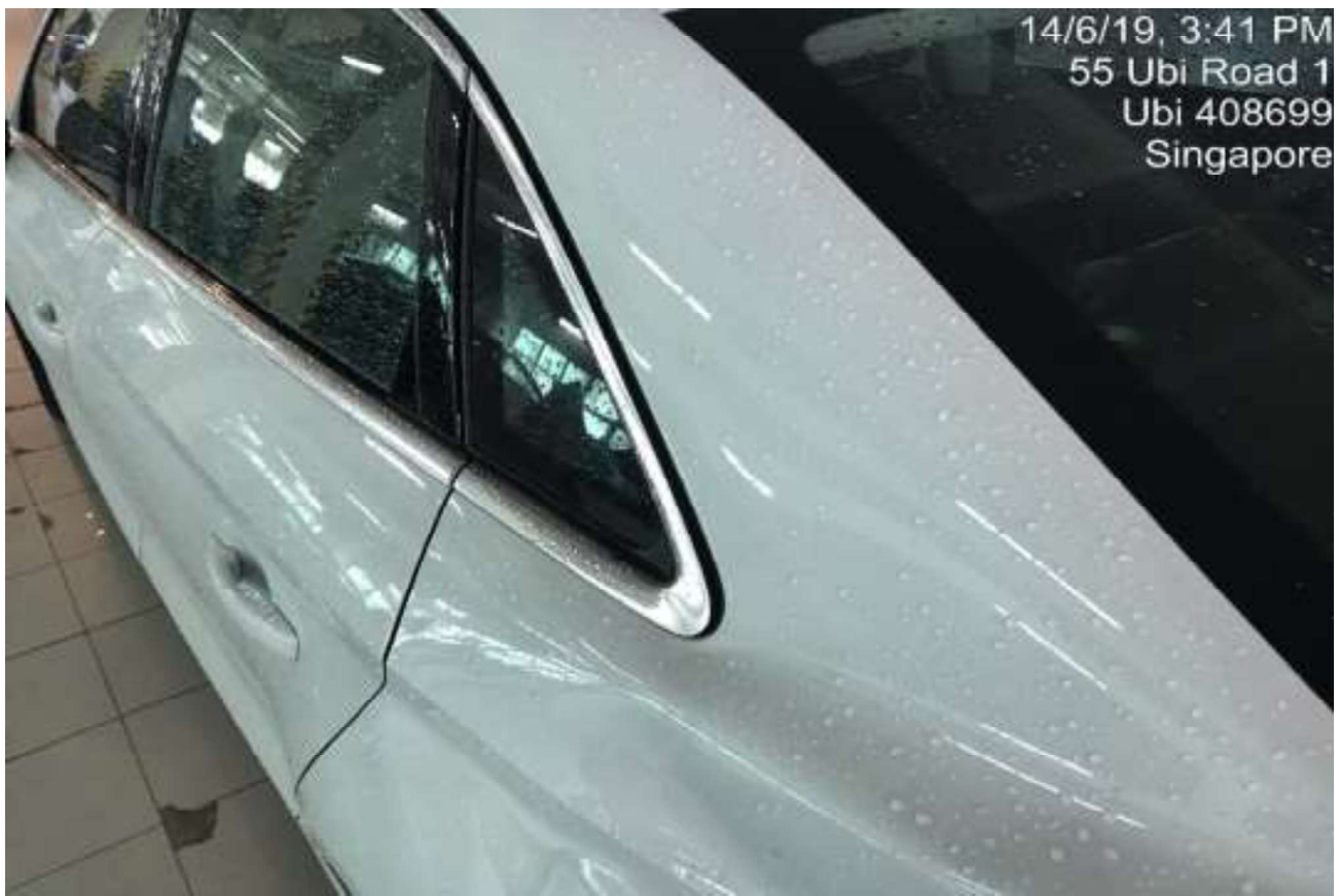
Photo 9 LHR QUARTER GLASS VIEW 2