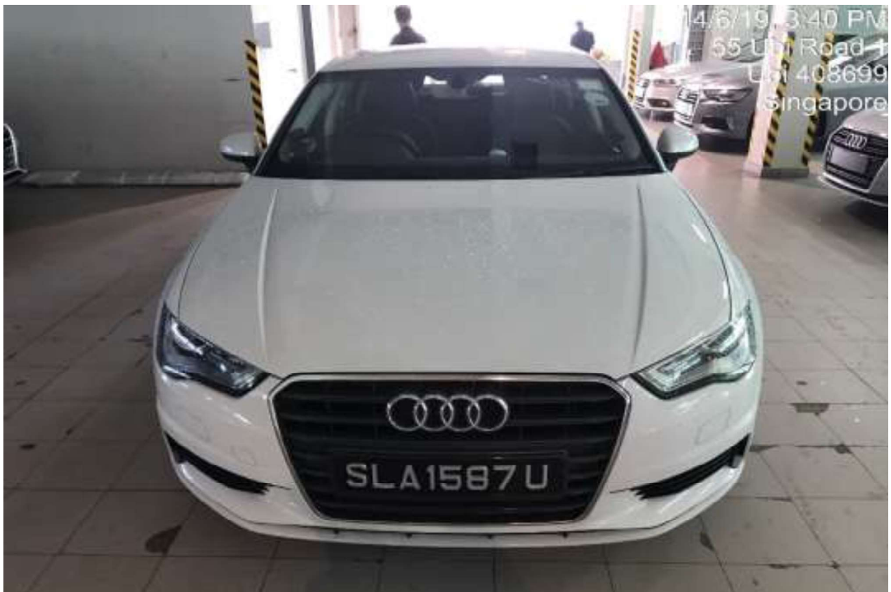
Photo 2 FRT VIEW