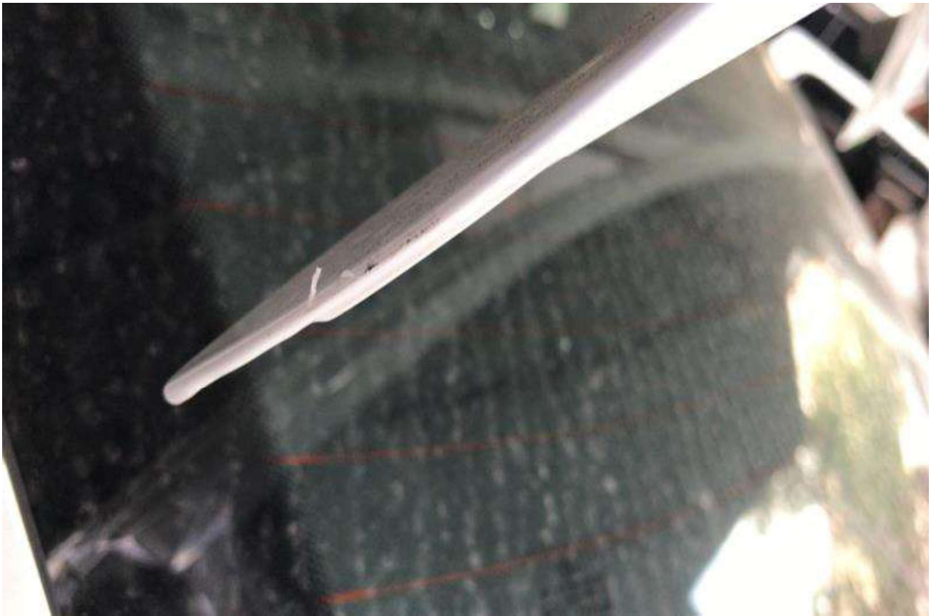
Photo 15 REAR BOOTLID PANEL CUT/SCRATCHED - REPAIR