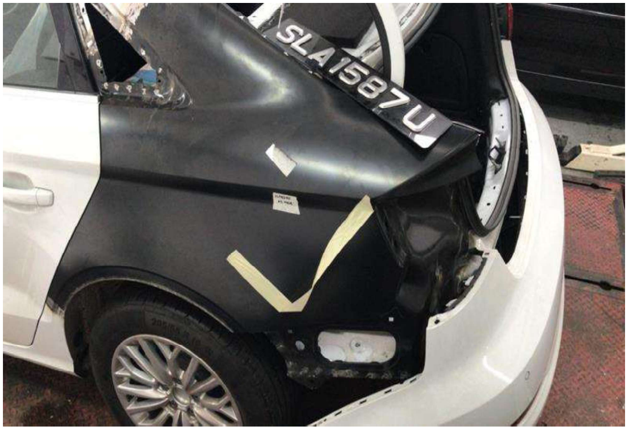
Photo 17 BEFORE PAINT VIEW 1