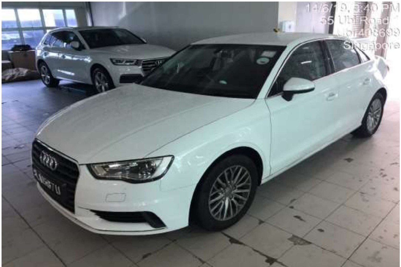
Photo 1 LHF VIEW

as indicated by Green markings are deemed consistent and areas or parts indicated by Red markings are not consistent.