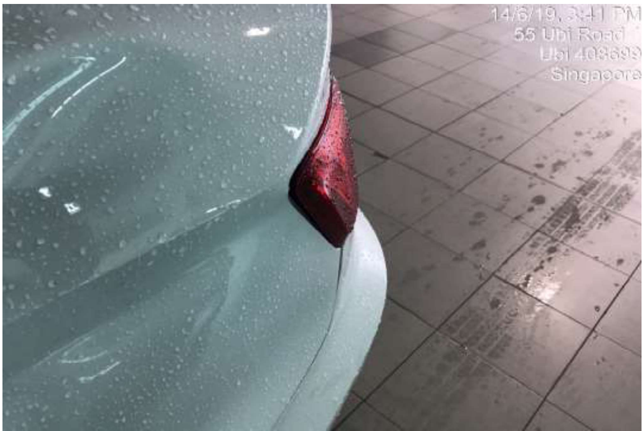
Photo 11 LHR TAIL LAMP VIEW 2