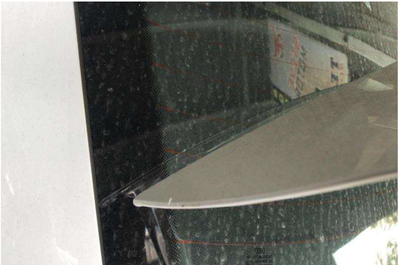
Photo 16 REAR BOOTLID PANEL CUT/SCRATCHED - REPAIR