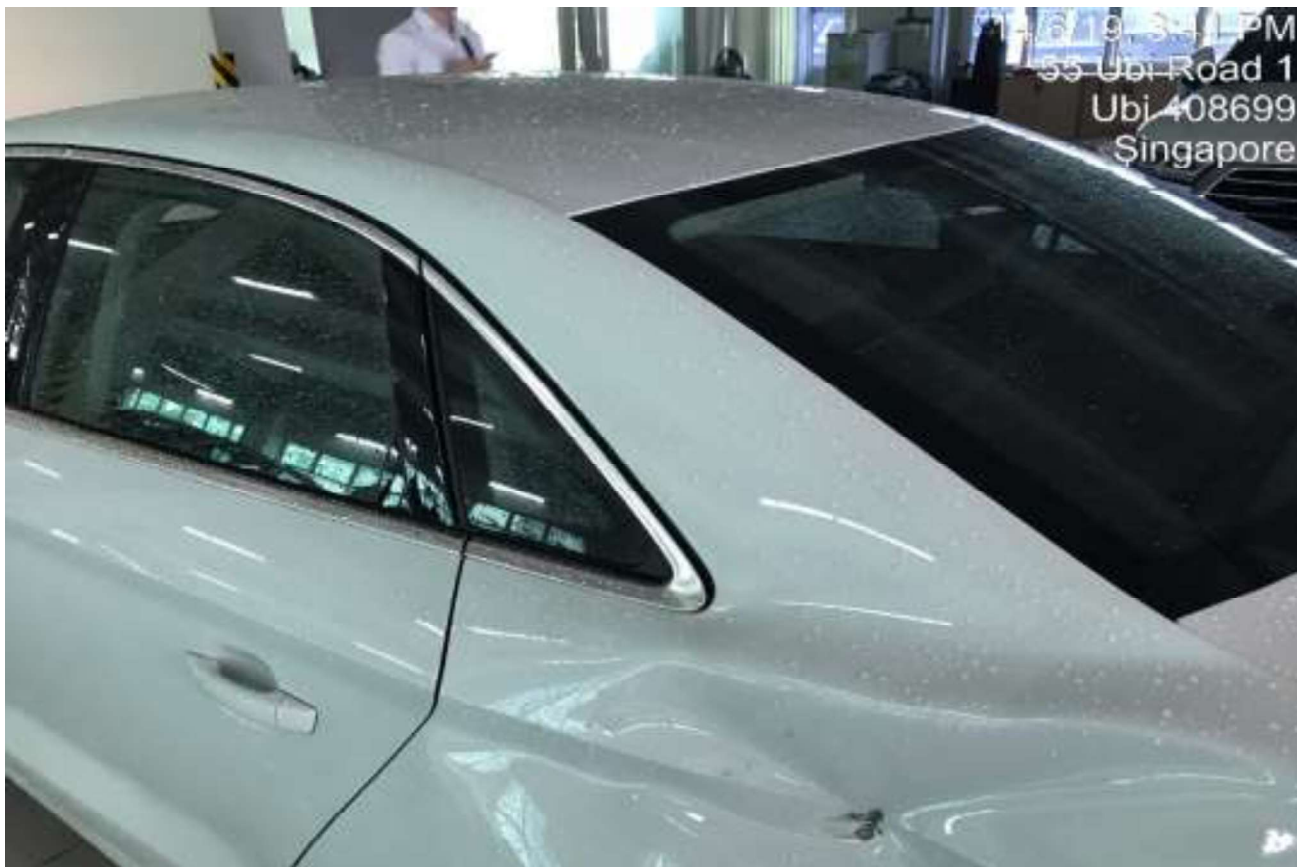
Photo 8 LHR QUARTER GLASS VIEW