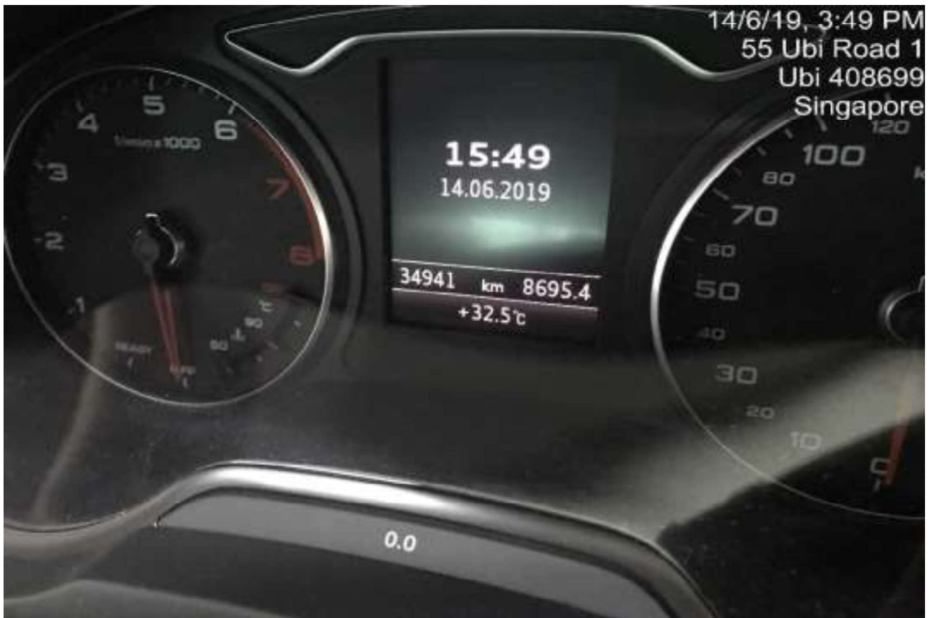
Photo 12 ODOMETER READING