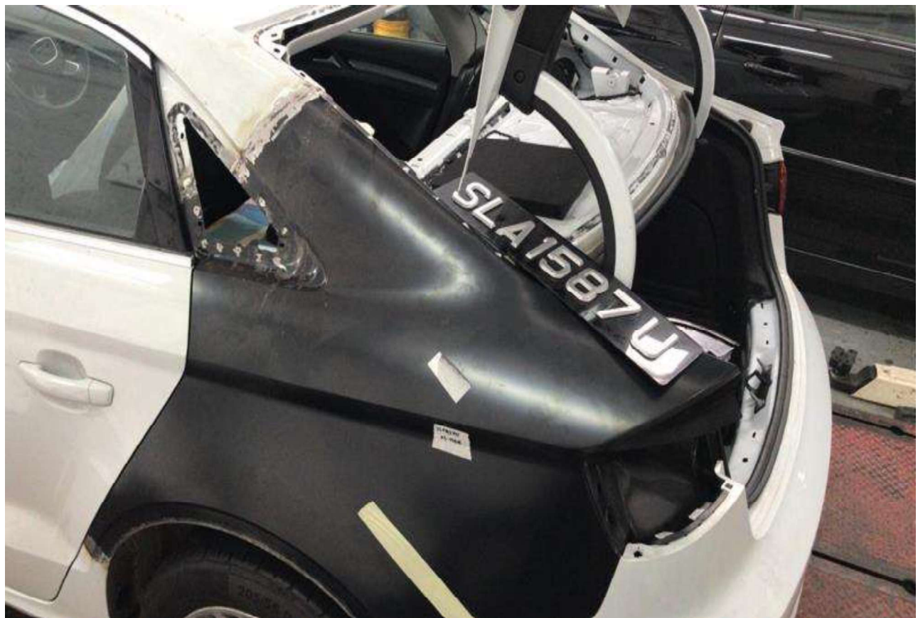
Photo 18 BEFORE PAINT VIEW 2