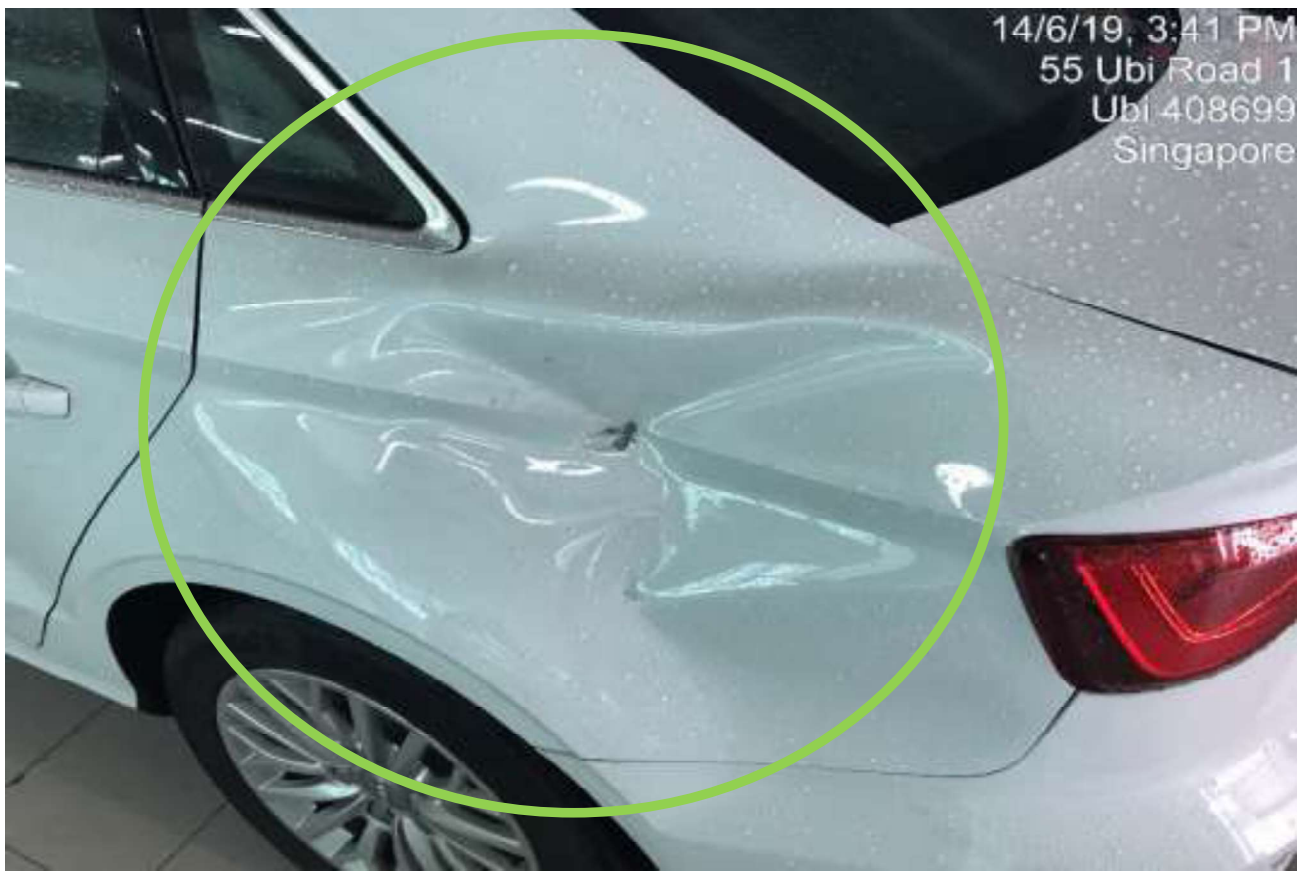
Photo 7 LHR FENDER BENT