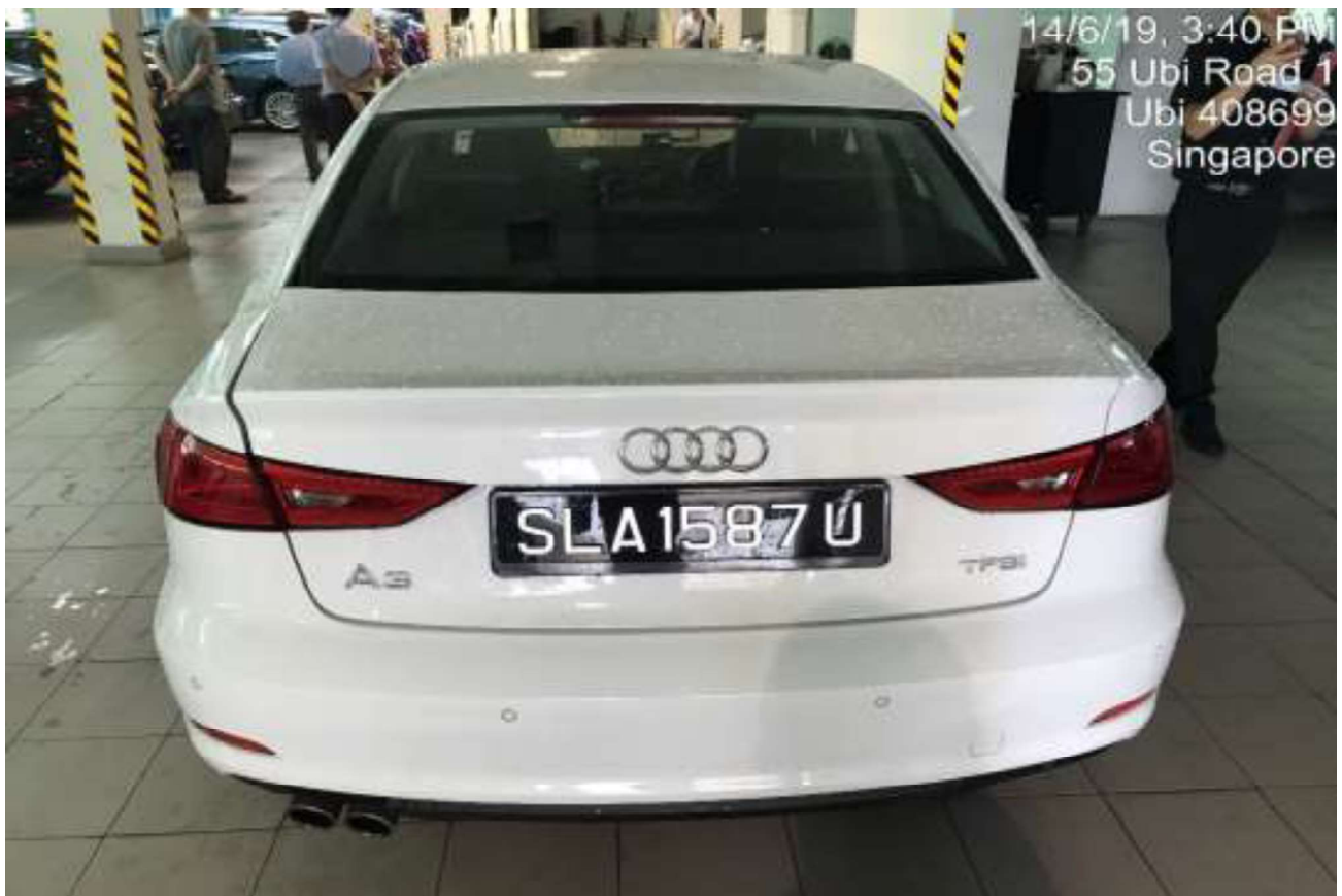
Photo 5 REAR VIEW