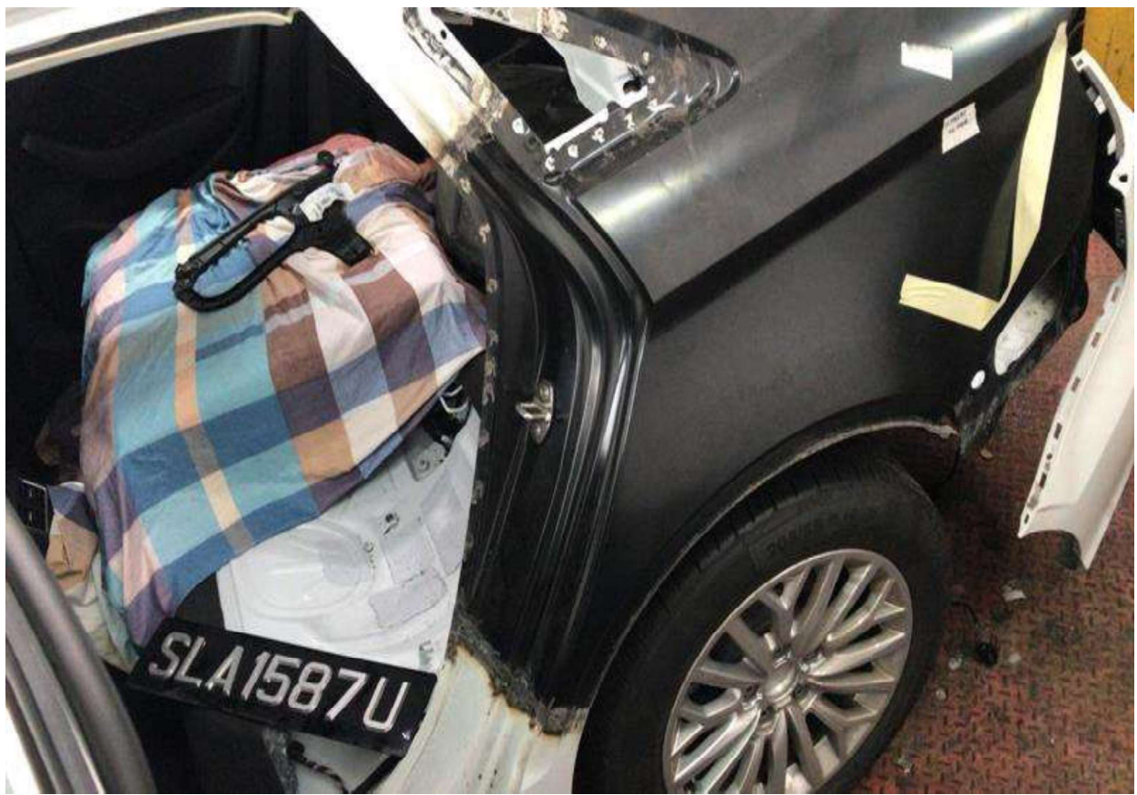
Photo 19 BEFORE PAINT VIEW 3