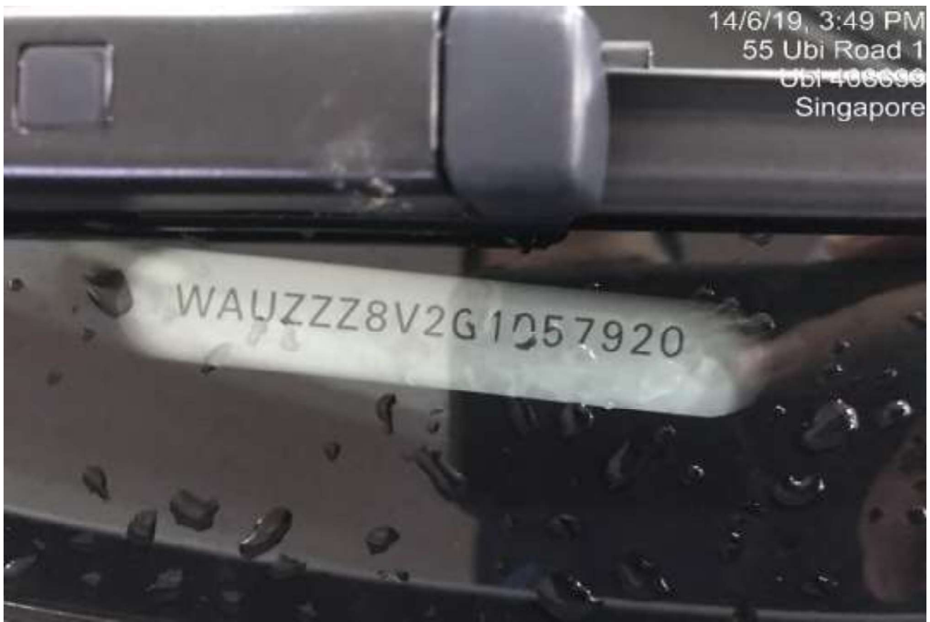
Photo 13 CHASSIS NO