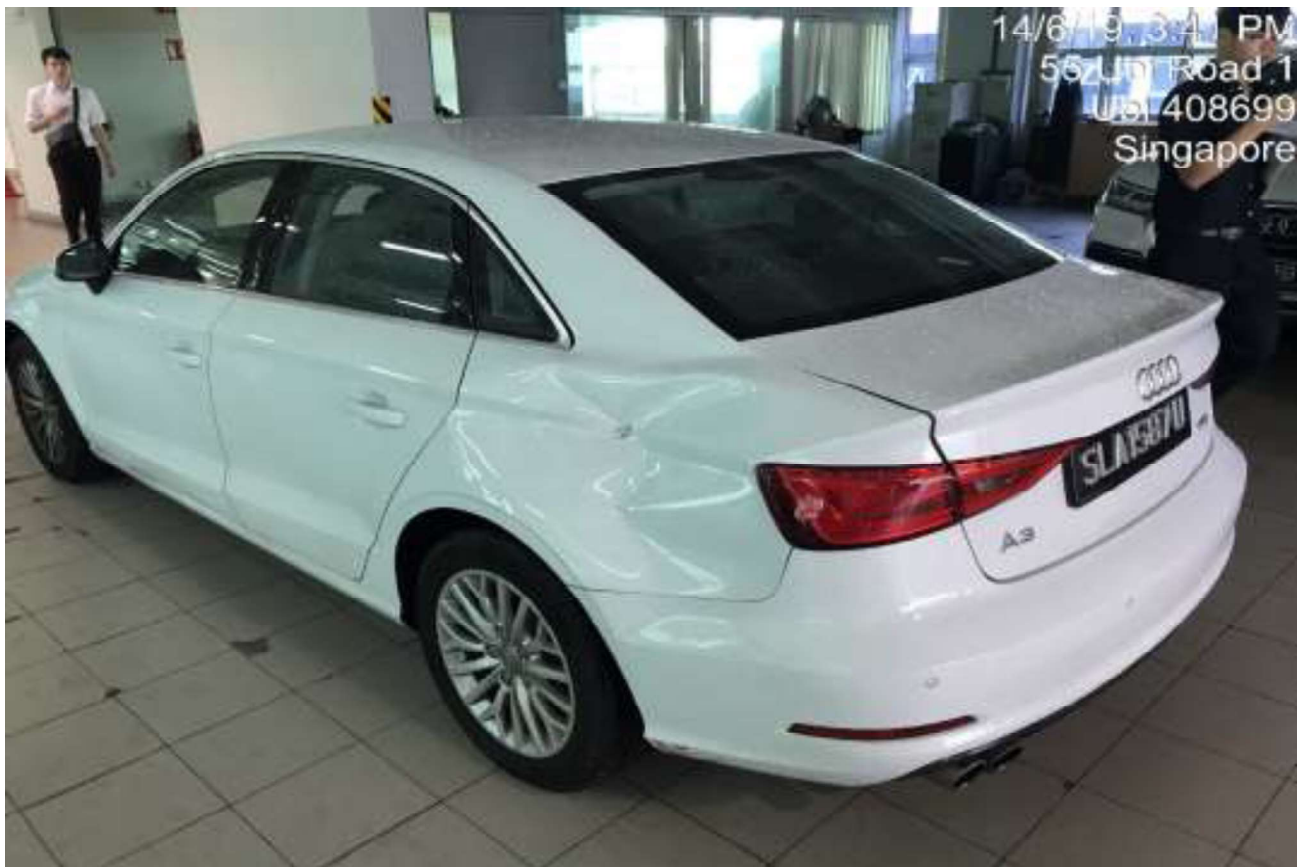
Photo 6 LHR VIEW