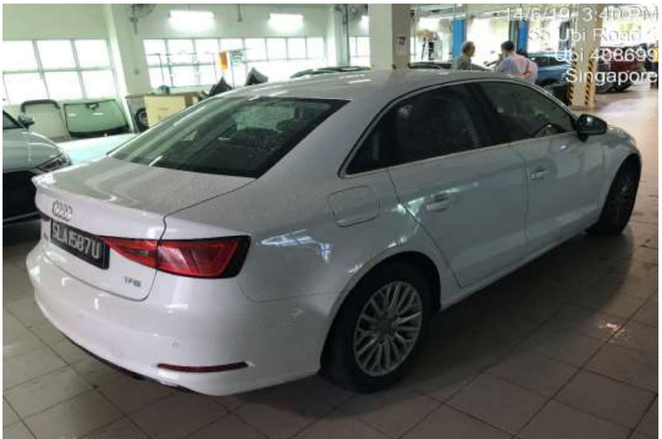
Photo 4 RHR VIEW