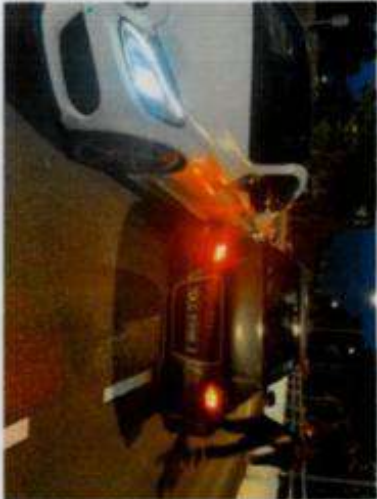
I stopped my car immediately after I got hit and after I hit car SCJ11E)