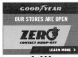
Zero Contact Drop-Off At Goodyear Partner Stores