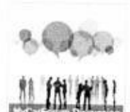
Singapore Reckless Drivers Part VIII

Home New Cars Used Cars Rental Cars Sell My Car Directory Products Insurance Article Forum Resources