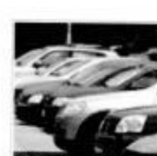
Singapore Reckless Drivers Part VIII

Home | New Cars | Used Cars | Rental Cars | Sell My Car | Directory | Products | Insurance | Article | Forum | Resources