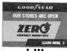
Zero Contact Drop-Off At Goodyear Partner Stores