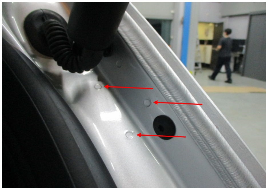
Photo 21 shows the right rear body panel of the Motor Car. I did not find any weld marks other than original spot weld marks (arrowed) on the non-detachable body panels of the Motor Car, indicating that there was no re-welding works carried out; and that the non-detachable body panels of the Motor Car were originally fitted.