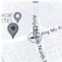
Image capture: Mar 2018