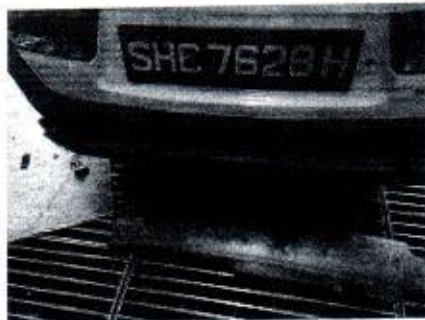
SHC7628H Q MARK (22).jpeg 186K

[This e-mail is confidential and may also be privileged. If you are not the intended recipient, please delete it and notify us immediately; you should not copy or use it for any purpose, nor disclose its contents to any other person. Thank you]