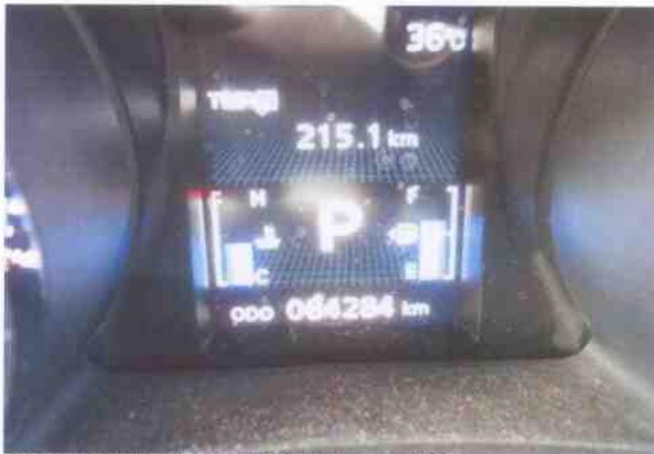
Photo 1 shows the mileage of the Motor Car was 084284 km.