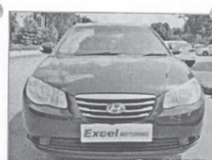
Hyundai Avante 1.6A S