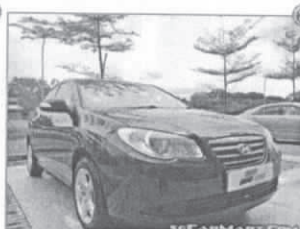
Hyundai Avante 1.6A S