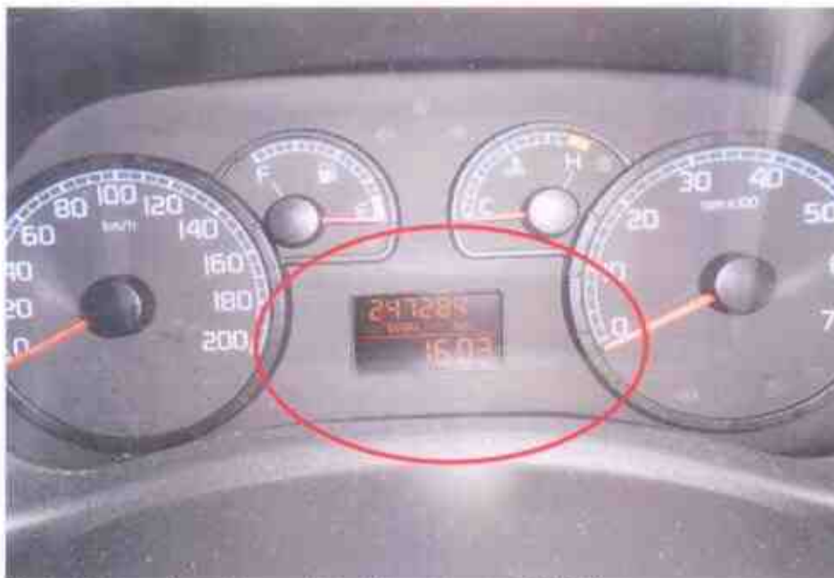
Photo 1 shows the mileage of the Motor Van was 247284km.