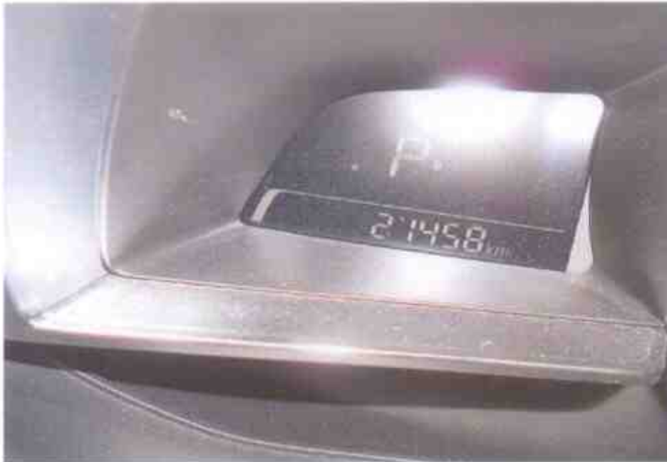
Photo 1 shows the mileage of the Motor Car was 21458 km.