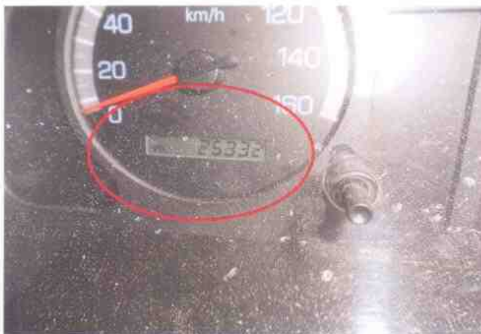
Photo 1 shows the mileage of the Motor Bus was 25332km.