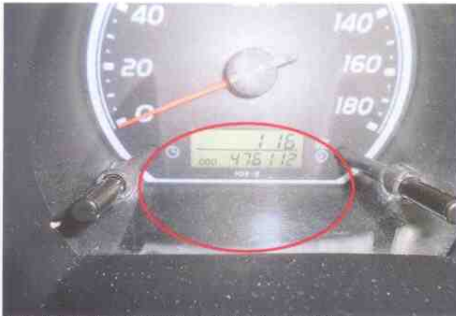
Photo 1 shows the mileage of the Motor Bus was 476112km.