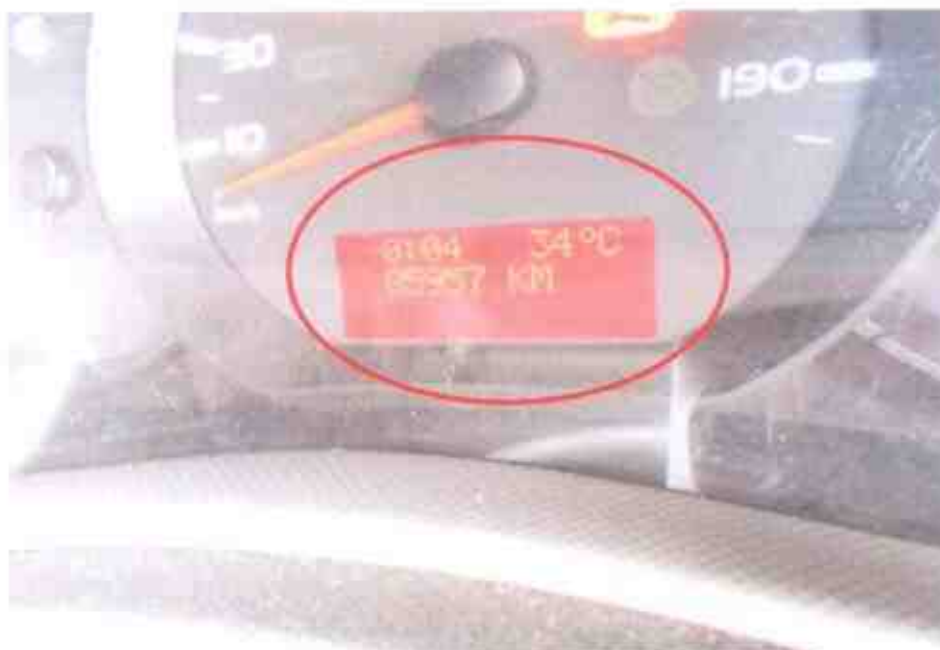
Photo 1 shows the mileage of the Motor Van was 85957km.