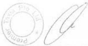
Premier Taxis Pte Ltd Authorized Signatory