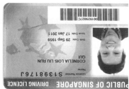
Driver NRIC and Driving Licence