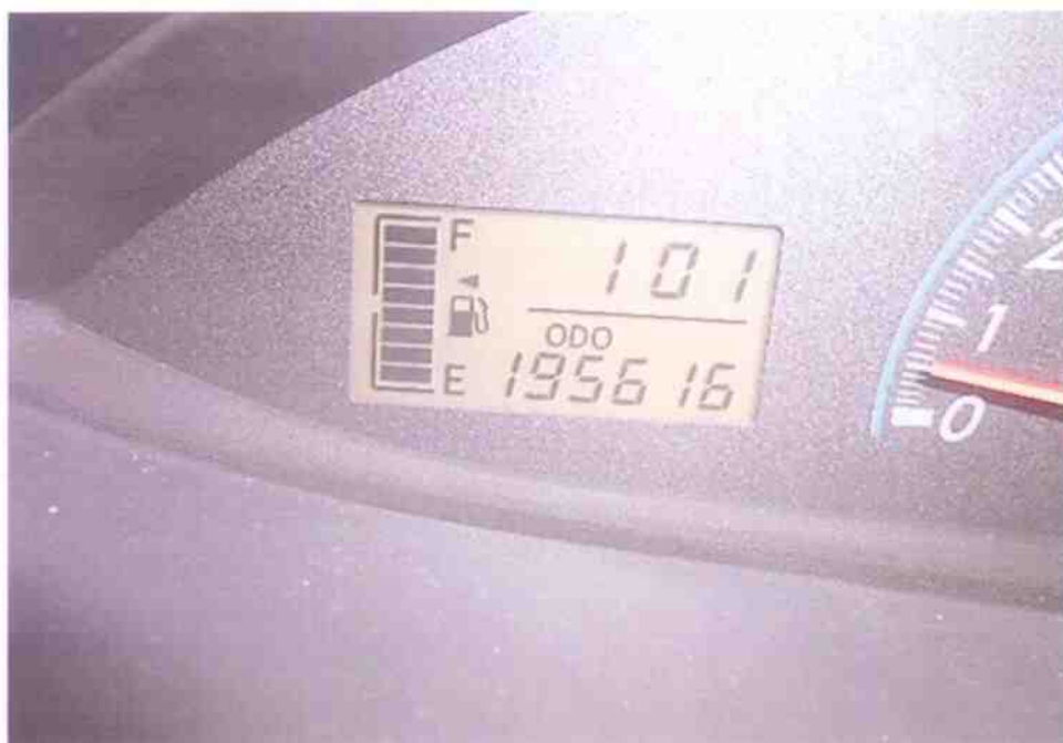
Photo 1 shows the mileage of the Motor Car was 195,616 km.