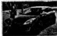
Suzuki gets new Swift brand ambassador