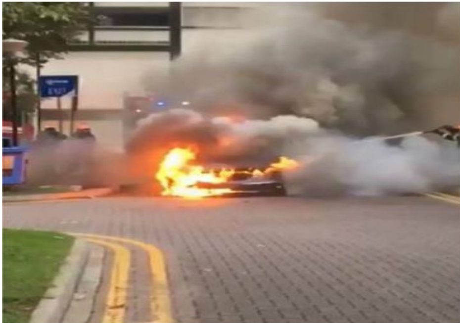
Photo 17 shows firefighters beginning to put out the fire.