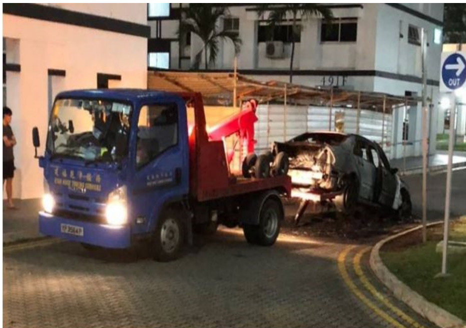
Photo 20 shows the Insured Vehicle being towed away.