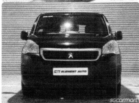
Peugeot Partner 1.6A HDi