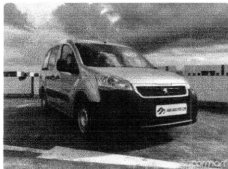
Peugeot Partner 1.6A HDi