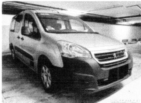
Peugeot Partner 1.6A HDi