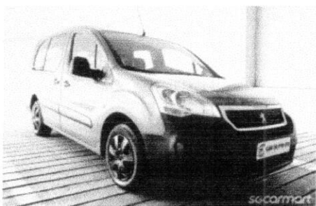
Peugeot Partner 1.6A HDi